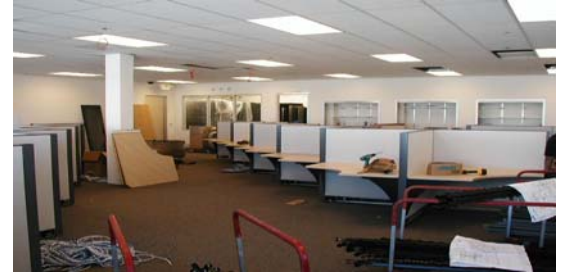
The "V" Formation