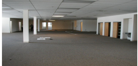
So Much Space