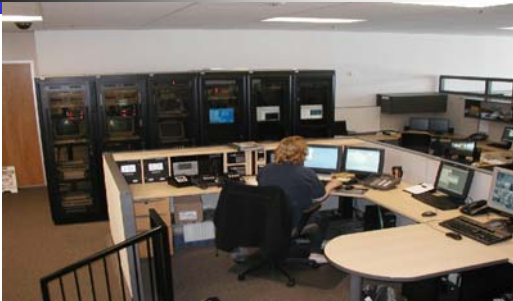
Fire, Access, Cameras & Concentrators