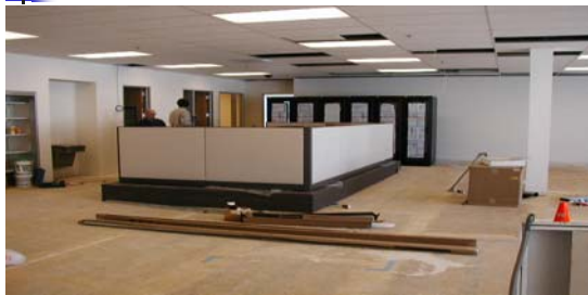
Our Supervisor Stations